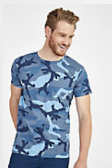
SOL'S CAMO MEN 01188